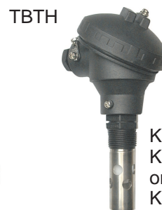
K=1, K=0.1 or K=0.01