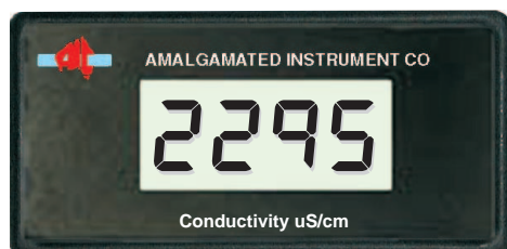
12.7mm 4digit LCD