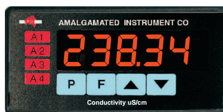
14.2mm 5 digit LED with keypad and alarm LED's (14.2mm 6 digit also available)