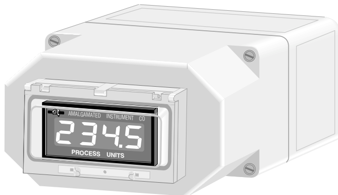
4 digit display in wallmount enclosure with IP65 cover